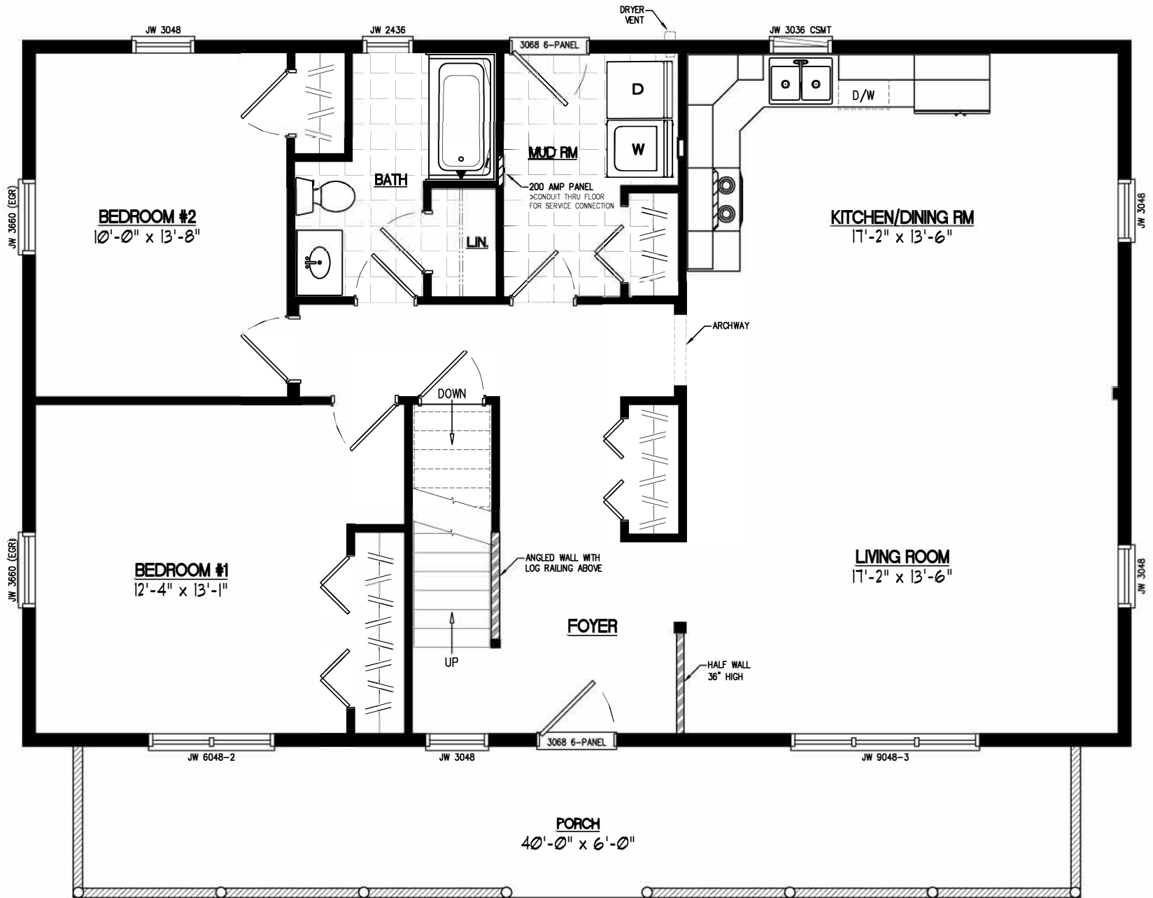
28x44 MOUNTAINEER Plan #28MR1304